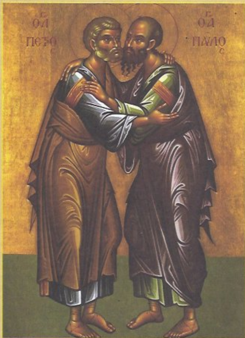
Icon of Saints Peter and Paul — June 29th