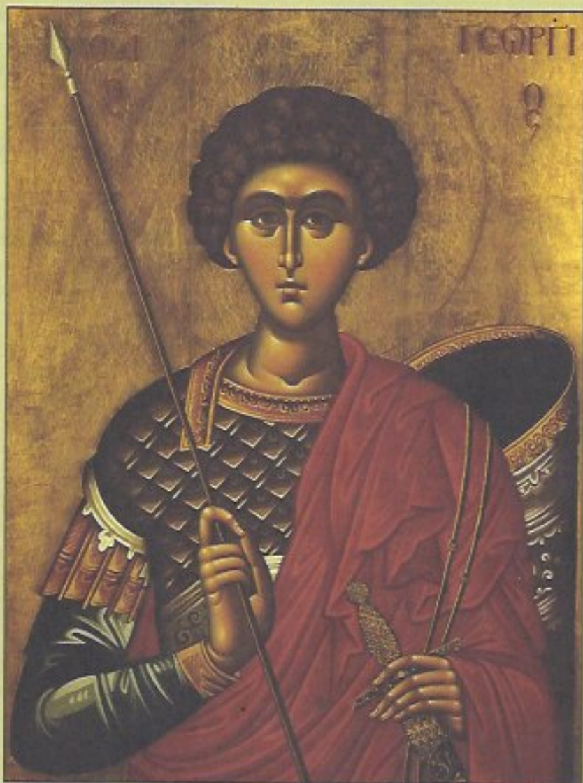
Icon of Saint George -- April 23rd